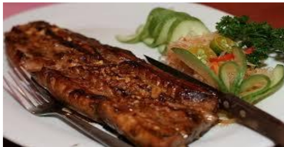
GRILLED TUNA (BELLY/PANGA/)