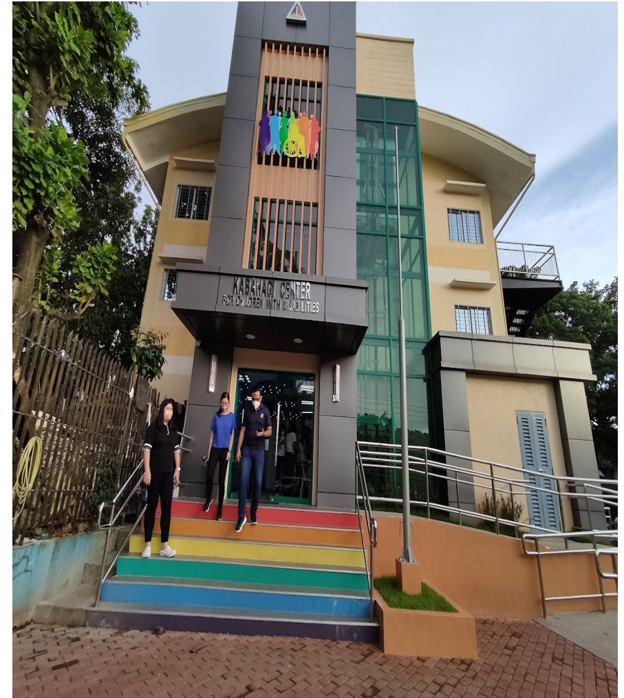
Orientation about Kabahagi Center during the Field Visit with the mothers of children with disabilities

The farm pioneers in maximizing hydroponic technology and address urban farming problem related to availability of land. It provides food and income to its members and even help other urban farming groups by transferring its earned farming technology and providing them with seeds and seedlings.